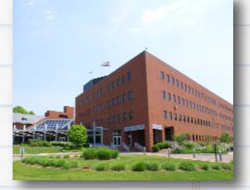
IMG's World Headquarters Indianapolis, Indiana USA

residence. To meet all of these needs, we have developed a comprehensive range of major medical, life, dental and disability products that can be tailored to meet individual specifications.