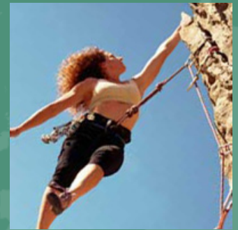
EXTREME SPORTS TRIPS

The Atlas Travel plan from HCC Medical Insurance Services (HCCMIS) is with you almost anywhere on the planet you may travel for vacations, studying abroad, corporate travel, mission trips and extreme sports adventures.